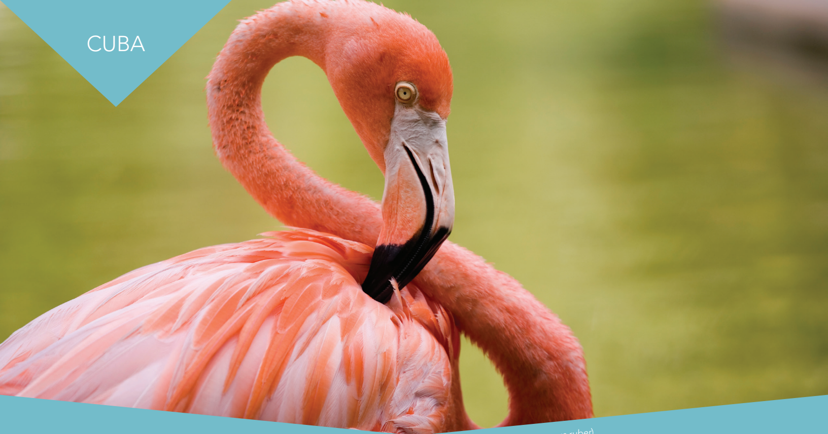
American Flamingo ( Phoenicopterus ruber )